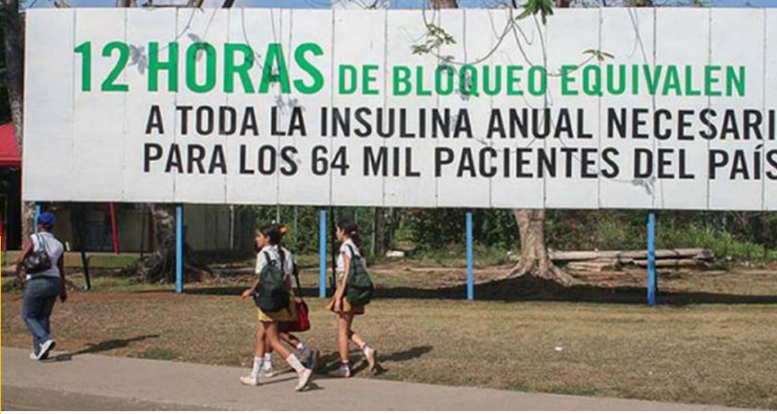
A billboard reads: Twelve hours of blockade is equal in cost to all the insulin needed to treat the country’s 64,000 patients for a year